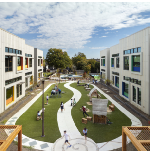
Sports fields, campus access improvements, and play structure replacements