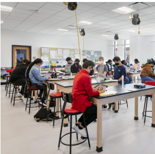
Learning environment modernization and updates