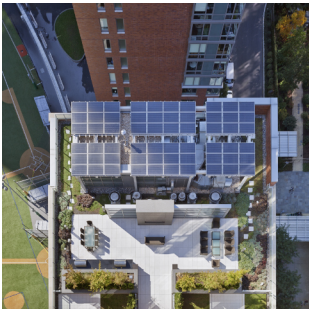
Energy efficiency, sustainability, and infrastructure improvements